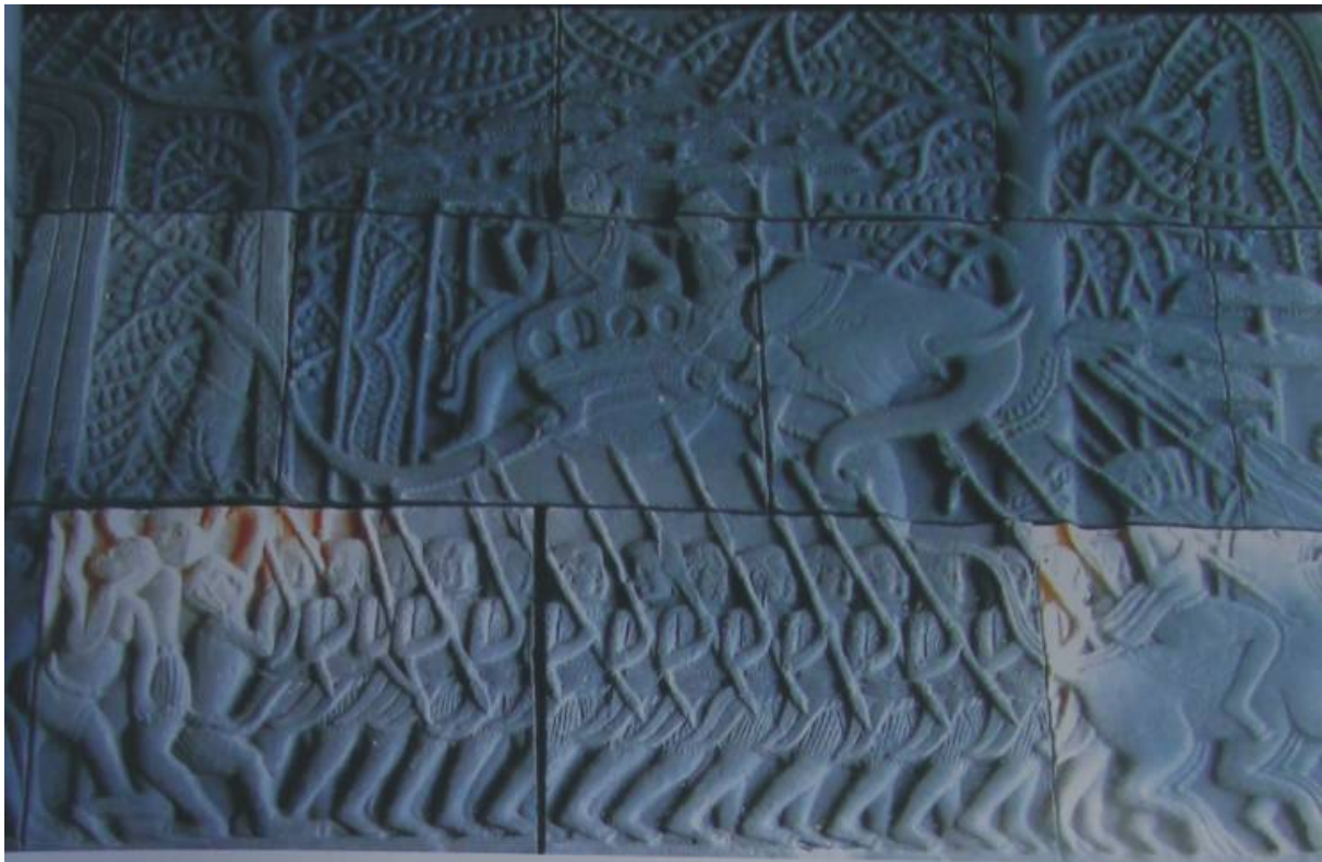
Section of a ceramic wall panel at National Center for Khmer Ceramics Revival.

that have been retrieved from an Iron-Age looted site in north west Cambodia. The vessels were destined for Thailand but they were purchased from villagers in a rescue operation by the Venerable Monk Pin-Sem and are now on display in specially built cabinets at Wat Bo, another of the teaching monasteries on the Siem Reap River. As head monk, Lokta Pin-Sem has travelled overseas and observed how other countries value their cultural heritage. He heard about the looting and, concerned at the loss of so much of Cambodia's cultural heritage already, he raised funds and made a special journey to the area to purchase the pots. The collection, which is only a tiny portion of the material looted from the site, now represents a valuable research tool for comparative studies by future researchers.