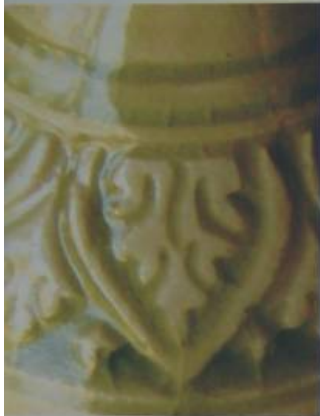
Detail of Khmer style decoration at National Center for Khmer Ceramics Revival.