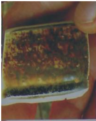
Glaze test made from local materials. National Center for Khmer Ceramics Revival.