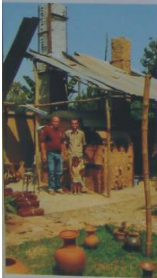
The kiln shed at National Center for Khmer Ceramics Revival.

demonstrated at the conference, perhaps the story extends back in time even further, as new ceramic evidence comes to light from previously unrecorded archaeological sites.