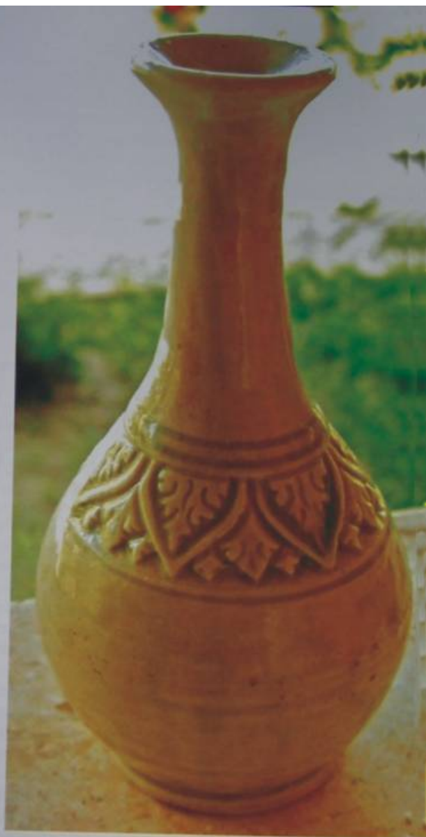
Ceramic Vase. National Center for Khmer Ceramics Revival.